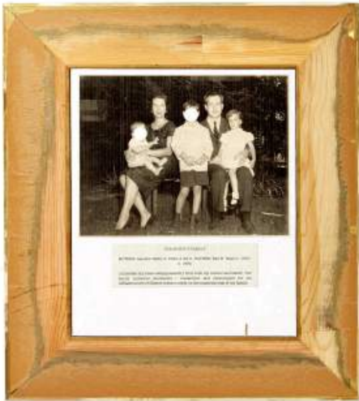
The Artist's Family 18.5"x 16.5"x 2" wallpaper frame, photocopy of a 1960 family photograph 2018