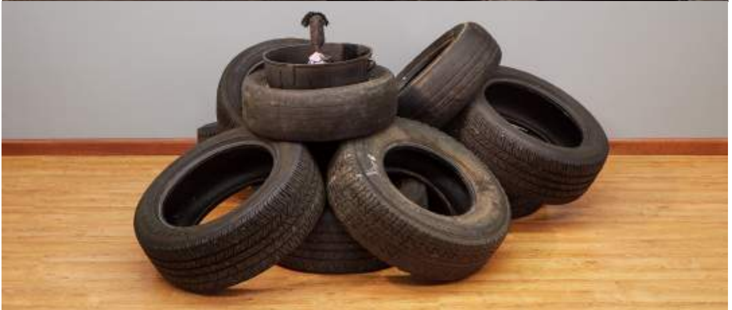
Tar Baby 36"x 50"x 66" tires, jambalaya pot, hand sewn doll, tar, 2018