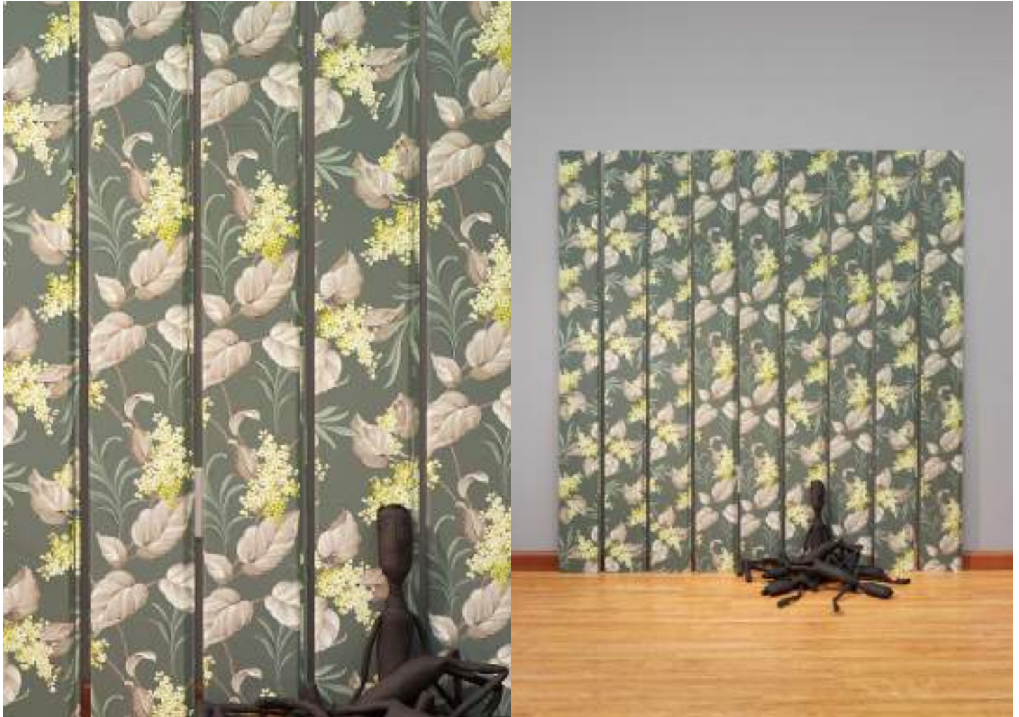
Fences 75"x 68"x 19" wood wallpaper, hand sewn dolls 2018