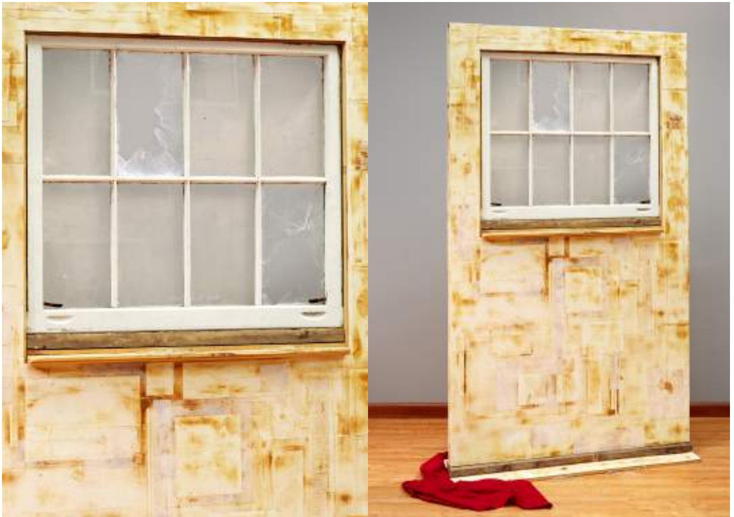
Broken Windows 83"x 48"x 14" wood, paper, lemon juice, window 2018