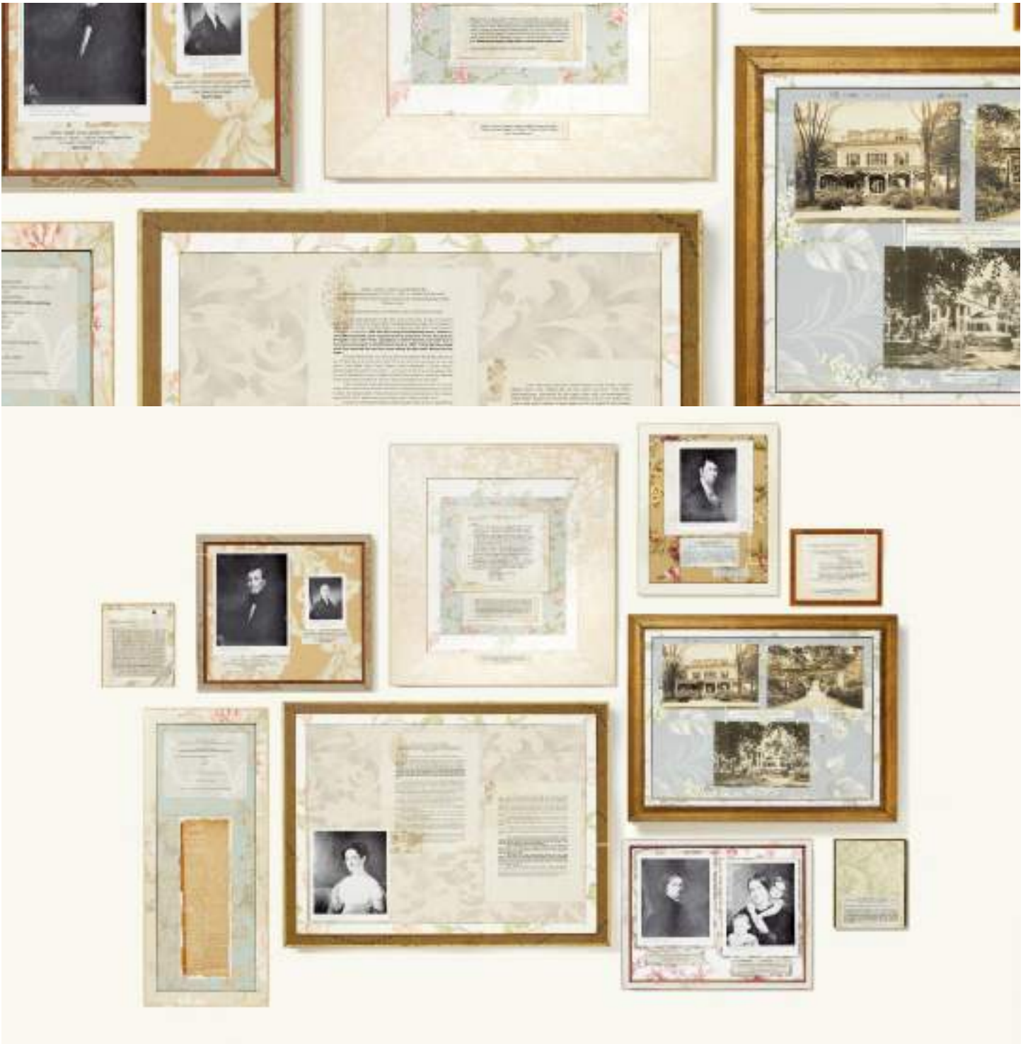
The Flip Side of Dark Things wallpaper the backside of 10 frames, photocopies of the artist's family documents exposing shameful ancestral roots in the institutions of slavery 2018