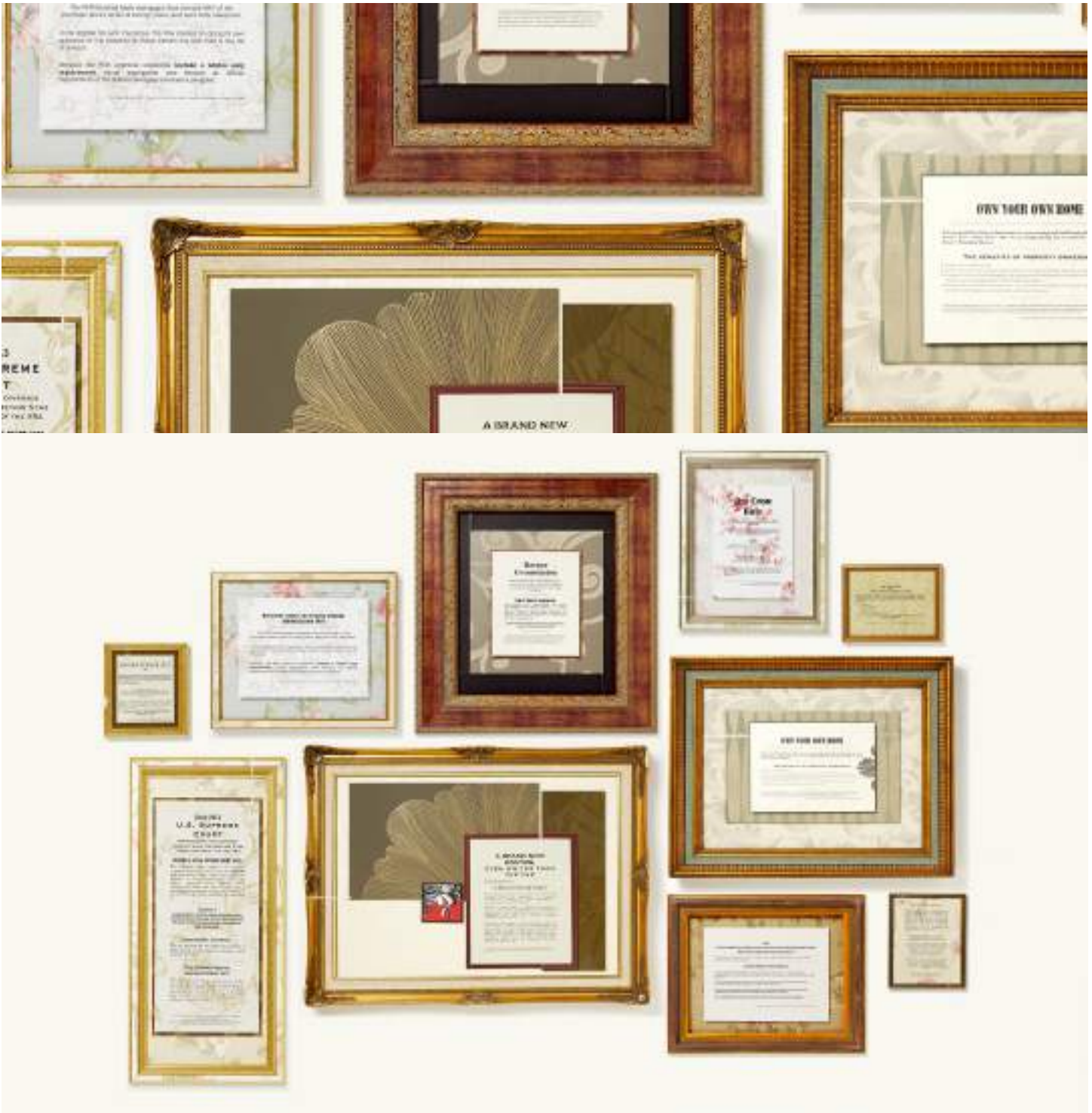
The Dark Side of Things wallpaper, 10 frames, text of racially explicit laws, regulations, policy, and government practices dimensions vary 2018