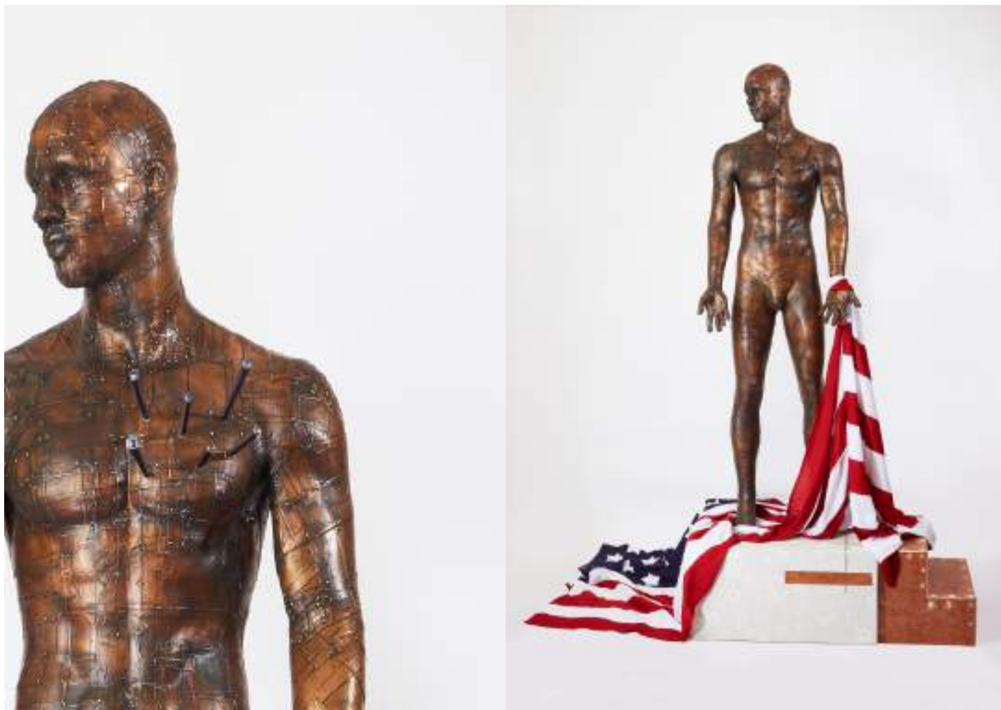
The Talk 90"x 75"x 60" mannequin, copper flashing, liver of sulfur, brads, iron nails, wood, wallpaper, hand sewn cotton flag 2018