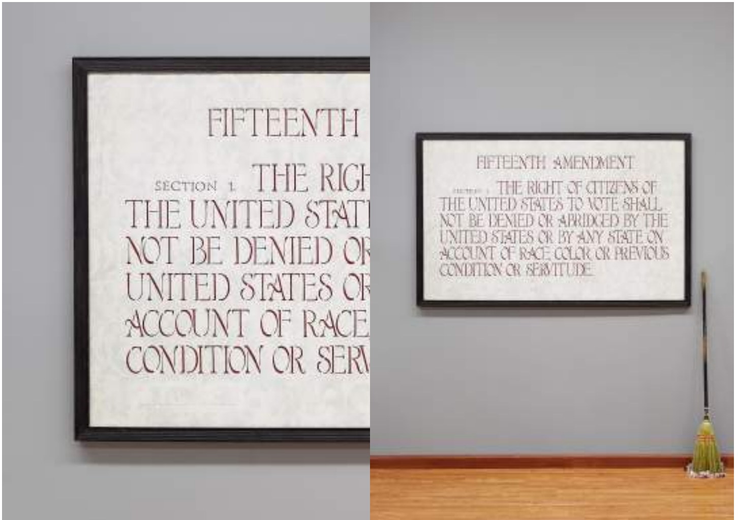
Death by a Thousand Cuts 42"x 66.5" polystyrene insulation, wallpaper, cotton bed sheet 2018